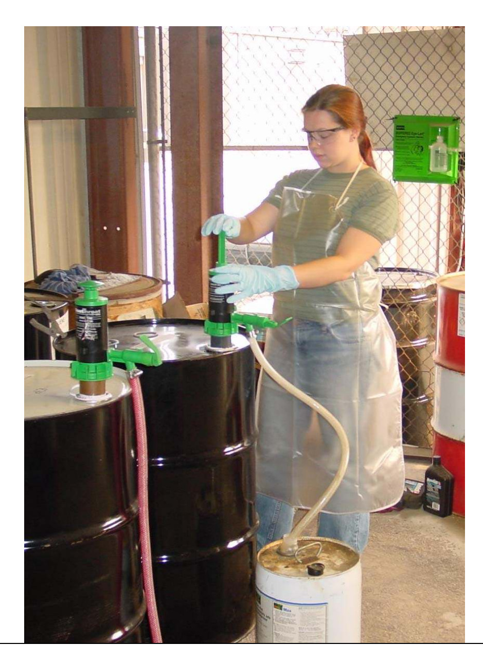
Biocides for Boiler Rooms