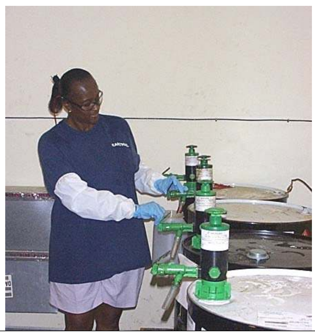
BEFORE AFTER DRUMS ARE RCRA* READY

Thousands of dollars saved monthly in chemical purchases and disposal costs