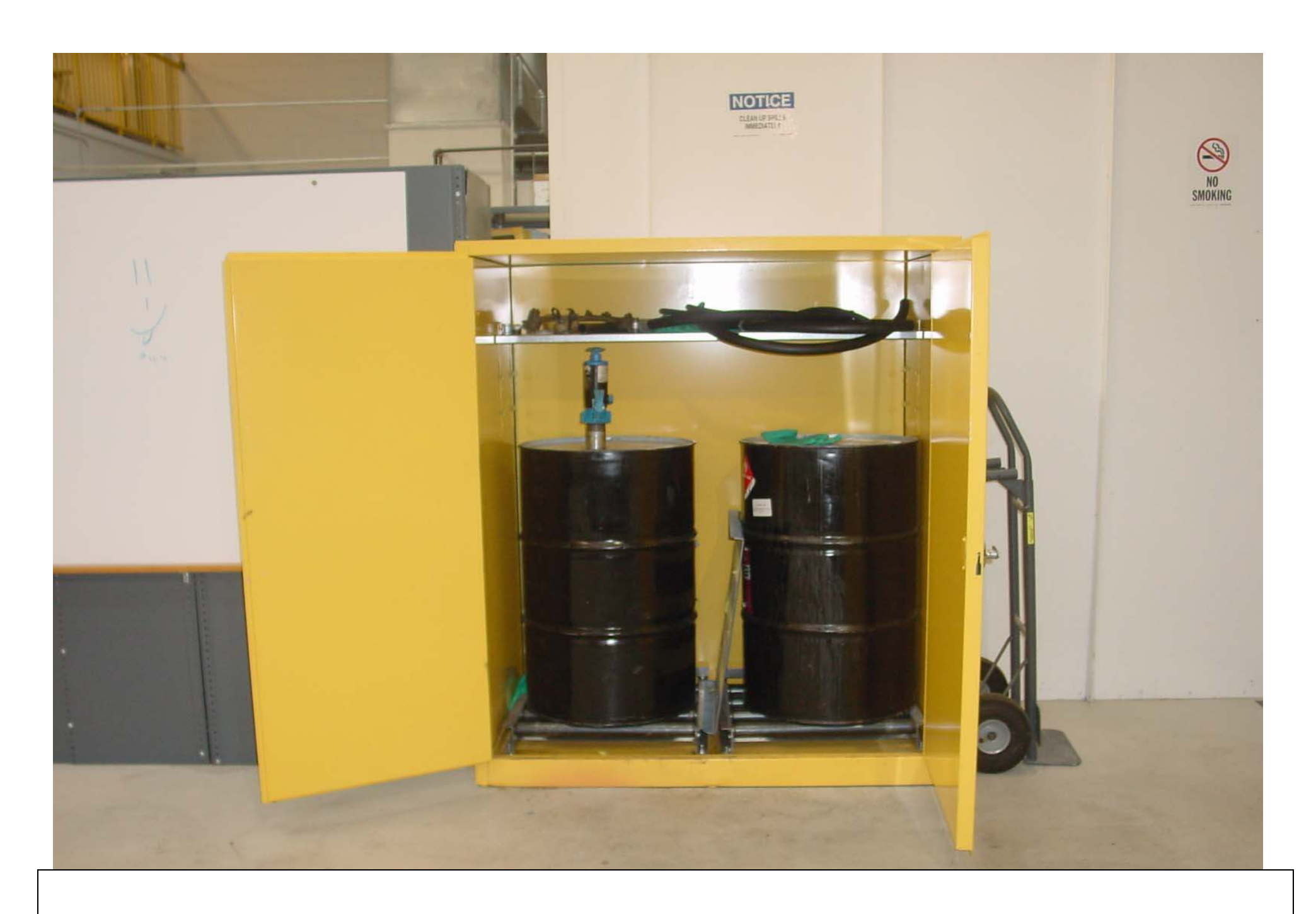
GoatThroat Stored in Safety Locker