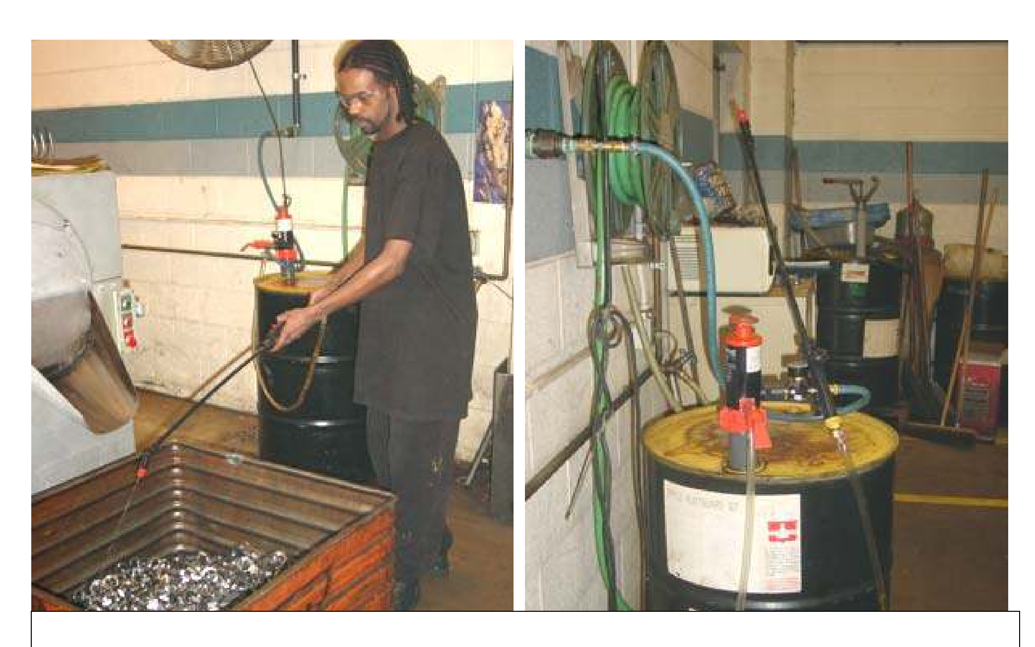
Applying rust-inhibitor with a sprayer using GoatThroat Pump and BillyGoat Shop Air Adapter