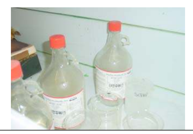
Before – Reagent grade acids @$1.08 per unit