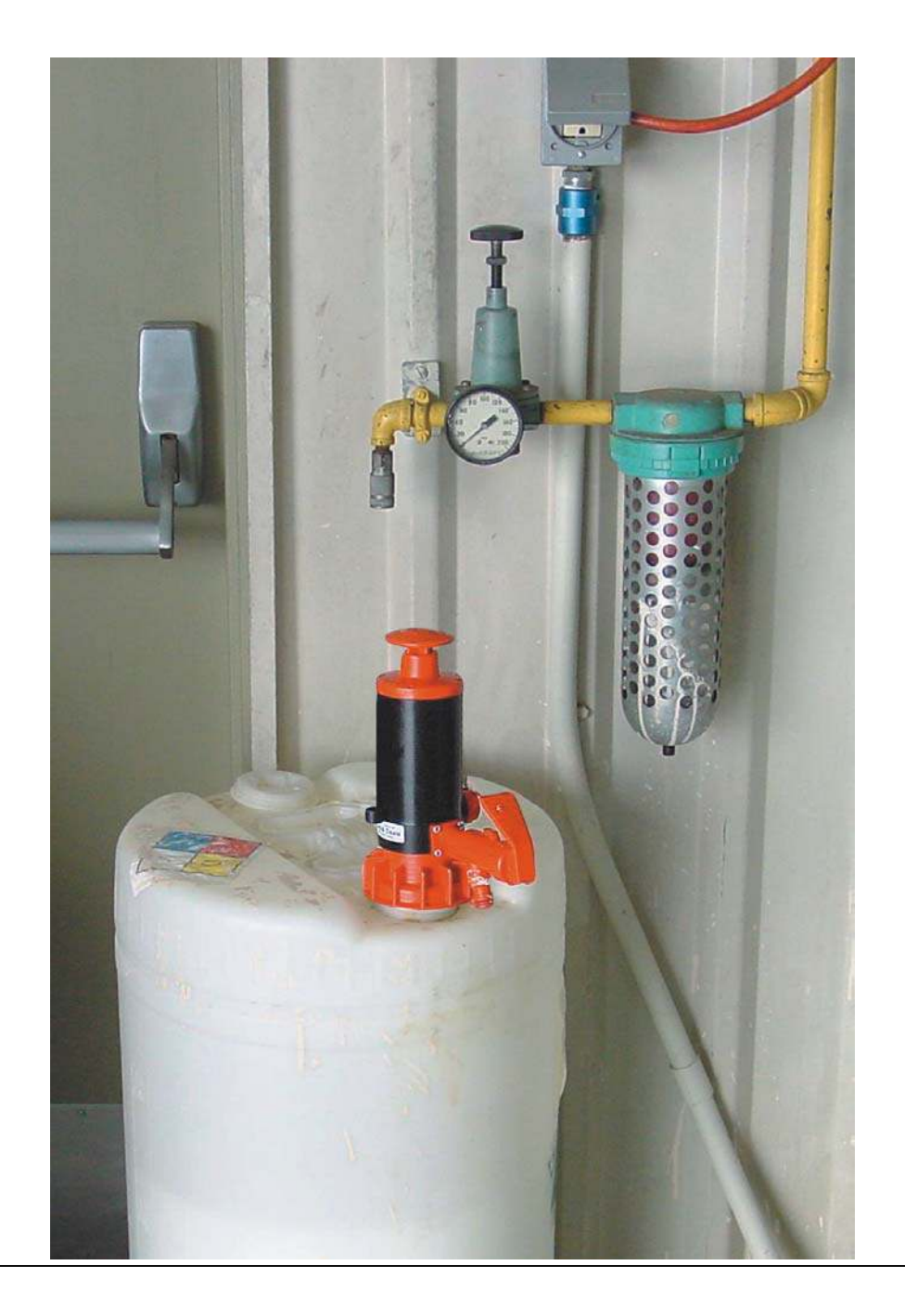
Brake Wash for Trucks