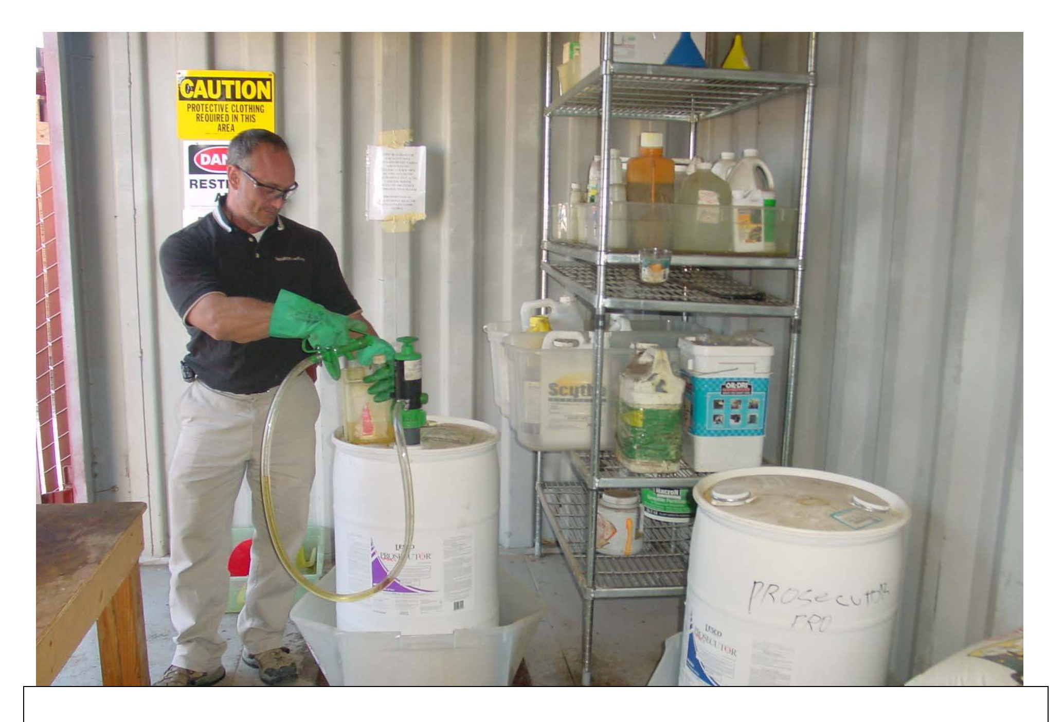
GoatThroat with Remote Tap for Lesco's <u>Prosecutor</u> (similar to <u>RoundUp</u>)