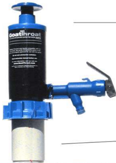
GT 200S Santoprene Pump